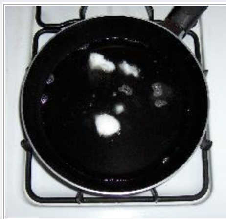
Melting Pork Fat (Lard)

Animal Fat: Use fresh beef fat or pork fat or bear fat. Animal fat will quickly become rancid and it should be melted ( rendered ) as soon as possible. Cut the fat into one-inch cubes and melt it over medium-low heat in a very small amount of clean rainwater in a clean cook pot. Do not allow it to smoke. If it starts to smoke then you are burning the fat.