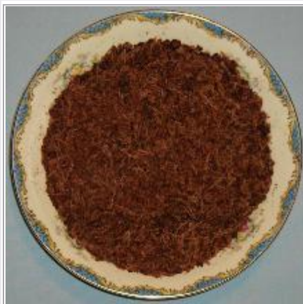
Dried Meat & Berry Mix

Animal Fat: Use fresh beef fat or pork fat or bear fat. Animal fat will quickly become rancid and it should be melted ( rendered ) as soon as possible. Cut the fat into one-inch cubes and melt it over medium-low heat in a very small amount of clean rainwater in a clean cook pot. Do not allow it to smoke. If it starts to smoke then you are burning the fat.