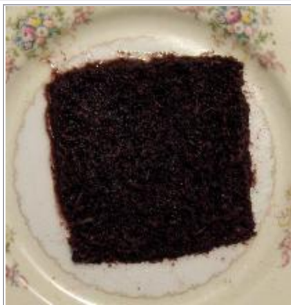
Melted Fat Added