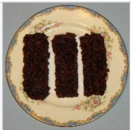
Finished Sliced Pemmican

When the fat is completely melted gradually pour it over the meat-fruit mixture in the bowl and stir until the mixture is well coated and sticks together. Then spread it out like dough and allow it to cool completely. When cool cut it into pieces about 1 inch wide and 4 inches long.